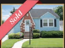
1322 Keswick Ave Haddon Heights 3Beds | 1.5Baths $305,000