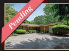
273 Chapel Heights Rd Sewell 3Beds | 2Baths | $409,900