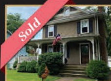
233 W Pine St Audubon 5Beds | 1.5Bath | $360,000