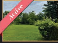
210 Centre Ave Mt. Ephraim New Constr | Land $350,000 | $65,000