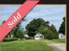
219 Walnut Ave Audubon Land | $150,000