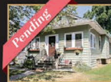
143 Carlisle Rd Audubon 3Beds | 1Bath | $249,900