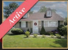
228 S Moore Ave Barrington 4Beds | 2Baths | $329,900