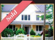
111 W Washington St Riverside 6Beds | 4.5Baths | $505,000