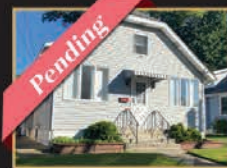
21 E Park Ave Oaklyn 3Beds | 2Baths | $235,000