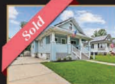
423 Washington Ter Audubon 3Beds | 1Bath | $335,000