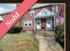
3 Dowling Ave Audubon 3Beds | 1Bath | $183,000