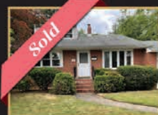
42 Melrose Ave Westmont 3Beds | 1.5Baths | $365,000