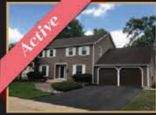
509 Guyer Dr. Haddon Heights 4Beds | 2.5Baths | $500,000