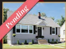
22 Campanell Ave Bellmawr 2Beds | 1Bath | $244,900