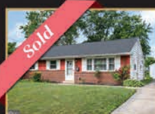
121 Hannold Blvd Woodbury 3Beds | 1Bath | $212,000