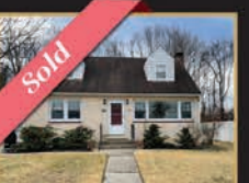
2008 Maple Ave Haddon Heights Multi-Family | $299,000