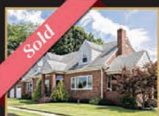
1725 Maple Ave Haddon Heights 6Beds | 4Bath | $475,000