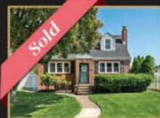
1607 W High St Haddon Heights 3Beds | 2.5Baths | $350,000