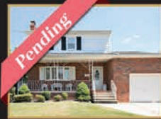
263 Cedarcroft Ave Audubon 4Beds | 1.5Baths $329,900