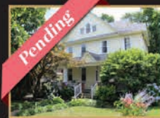
124 W Atlantic Ave Haddon Heights 5Beds | 2.5Baths | $529,900