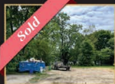
132 Kingston Ave Barrington Land | $115,000