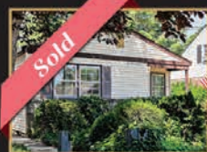
244 Cedarcroft Ave Audubon 3Beds | 1Bath | $220,000