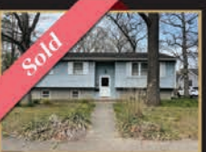
47 E 12th Ave Pine Hill 4Beds | 1.5Baths $230,000