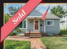
1703 Maple Ave Haddon Heights 3Beds | 2Baths | $340,000