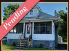
35 Progress Ave Woodbury 3Beds | 1.5Baths $150,000