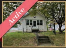
31 11th Ave Haddon Heights 4Beds | 1.5Baths | $329,900