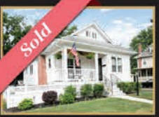
108 Cedarcroft Ave Audubon 3Beds | 2Baths | $400,000