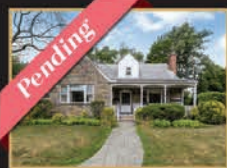
13 Station Ave Haddon Heights 4Beds | 2Baths | $500,000