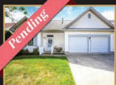
98 Morning Glory Ln Woodbury 2Beds | 2Baths | $320,000