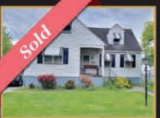
20 5th Ave Mount Ephraim 4Beds | 2Baths | $263,000