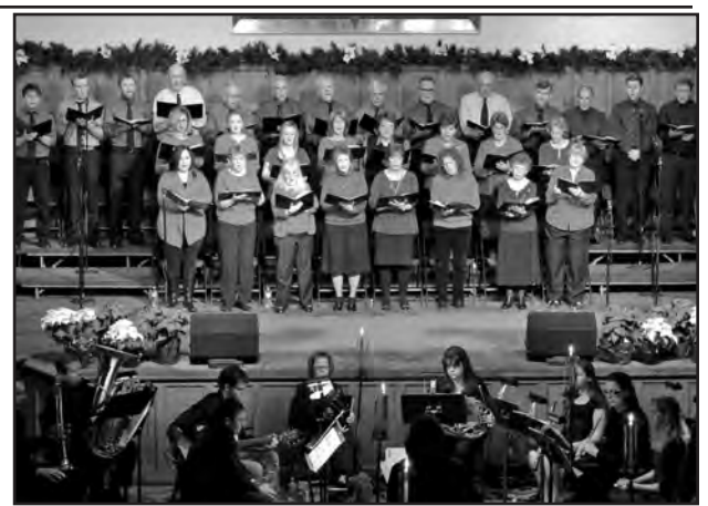
The Haddon Heights Baptist Choir and Orchestra presents "A Great and Mighty Wonder" on Sunday evening, December 18th, at 6:00 pm.

AWANA continues it's club year in December with Christmas crafts and caroling to shut-in in the community. AWANA, which stands for Approved Workmen Are Not Ashamed, is a kids club for children