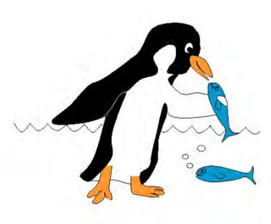
beak cold fish ice penguin wing