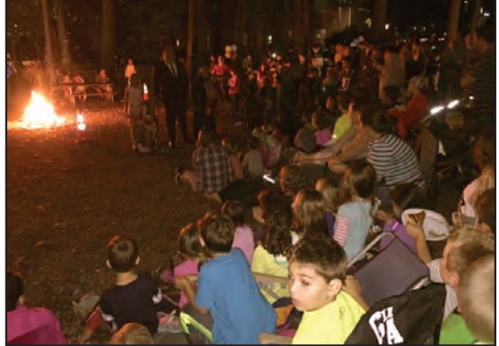
Over 250 people enjoy a free night out at the HHNNO Community Bonfire and help raise funds for the Small Explorers Playground at Hoff's Park.

Kings Highway as well as rolled out the mobile digital community calendar. With your help we were also able to support many community programs including library programming, KidTime at the Market, garden programs at the elementary schools, HHHS theater production, HHYA and HHSC, HHFHC Color Run, HHPTG, the Easter egg hunt, the July 4th 5K, the Farmer's Market, Haddon Heights Sons of Italy, Haddon Heights Fire Department and the Camden County Police Unity Tour and more all while also holding successful events that bring together neighbors young and old. Many thanks to the community of Haddon Heights and all the volunteers that make Haddon Heights the "friendly community."