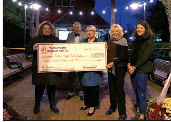
HHNNO presents Haddon Heights Good Neighbors with a $500 donation at the fountain park ribbon cutting.

In 2016, Haddon Heights Neighbors Night Out also completed a welcome sign project on